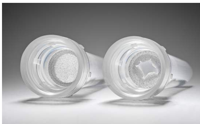
Figure 2. Image comparing the intact pierceable barrier and a barrier pierced barrier with after using the tool shown in Figure 1 .