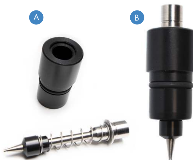
Figure 1. Piercing tool from DPX Technologies designed for compatibility with Hamilton Robotics platforms. Allows for on-deck piercing which replaces manual cap or plug removal.

Automated piercing and the DPX patent-pending process for INTip Swelling eliminates all pre-ALH steps such as slurry preparation, column packing, centrifugation, and manual cap or plug removal.